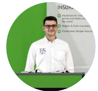
EIS - European Insurance & Services